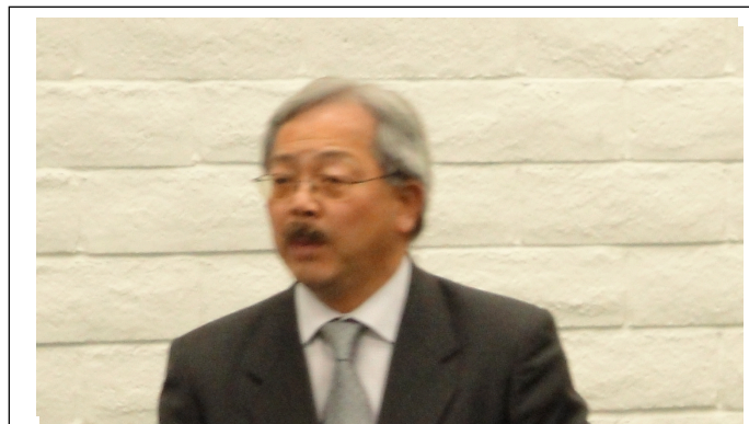
Mayor Ed Lee at the May 2015 METNA meeting.