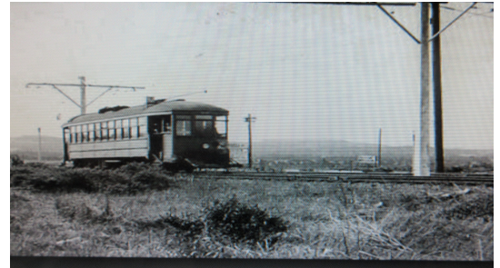
M Oceanview at Eucalyptus & 19 th Av, February 1939

Except for the five year hiatus (August, 1939 to December, 1944) the M-Ocean View streetcar/Muni metro line has been a workhorse serving the Oceanview-Merced Heights-Ingleside neighborhoods for 90 years, providing vital service and connecting the south-west corner of San Francisco to the rest of the City.