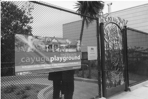
Cayuga Playground, Alemany Blvd. Entrance