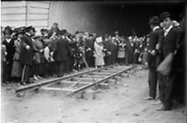
Mayor James Rolph during ceremonial laying of track at West Portal, Fall, 1917