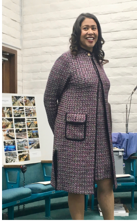
Mayor London Breed at METNA meeting, Nov. 2018