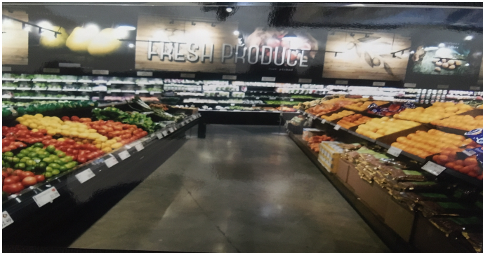
Hmart in San Jose on Oakland Rd.