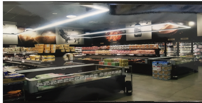
Hmart in San Jose on Oakland Rd.