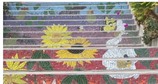
Ramsell stairs mosaic tiles

This past fiscal year, July 1, 2023 to June 30, 2024, the MET recorded 29.35 inches of rain. December's total was 8.45 inches, with January 2024 at 7.15 inches in the MET. February's total was 5.40 with 11 days of rain, and by the end of February the year to date total had reached 22.40. Keeping backyards clear of weeds, and the open space areas of the city need to be kept mowed and cleared of tall grass. Report any tall grass areas to 311, to prevent possible random fires.